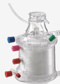
Affinity Fusion™ Oxygenator