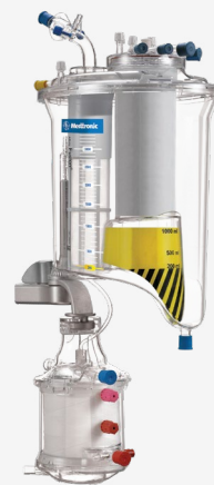
Affinity Fusion™ Oxygenation System