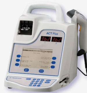
ACT Plus™ Automated Coagulation Timer