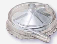
Affinity™ CP Centrifugal Pump