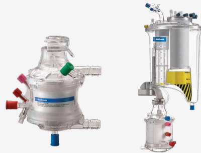
Affinity Pixie™ Oxygenator