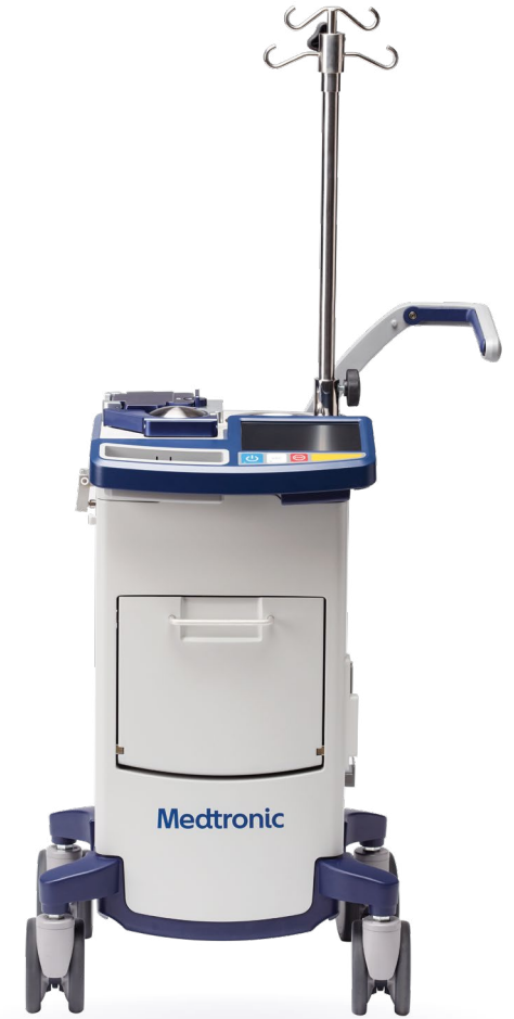
autoLog IQ™ Autotransfusion System