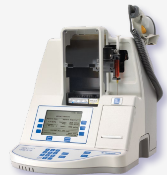
HMS Plus Hemostasis Management System