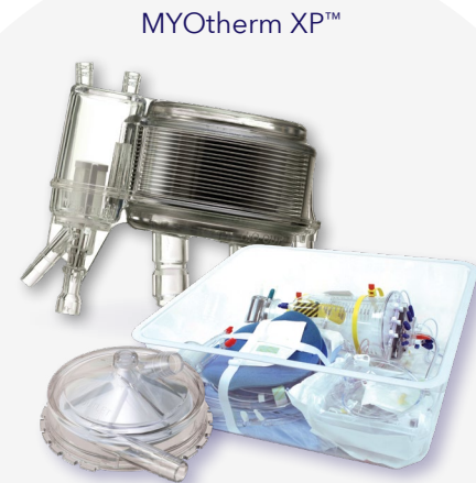
Affinity™ CP Centrifugal Pump