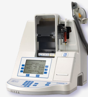
HMS Plus Hemostasis Management System