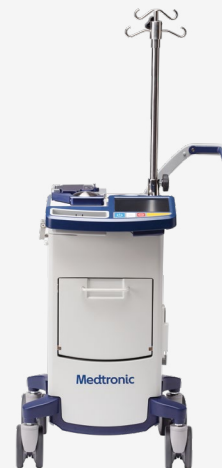
autoLog IQ™ Autotransfusion System